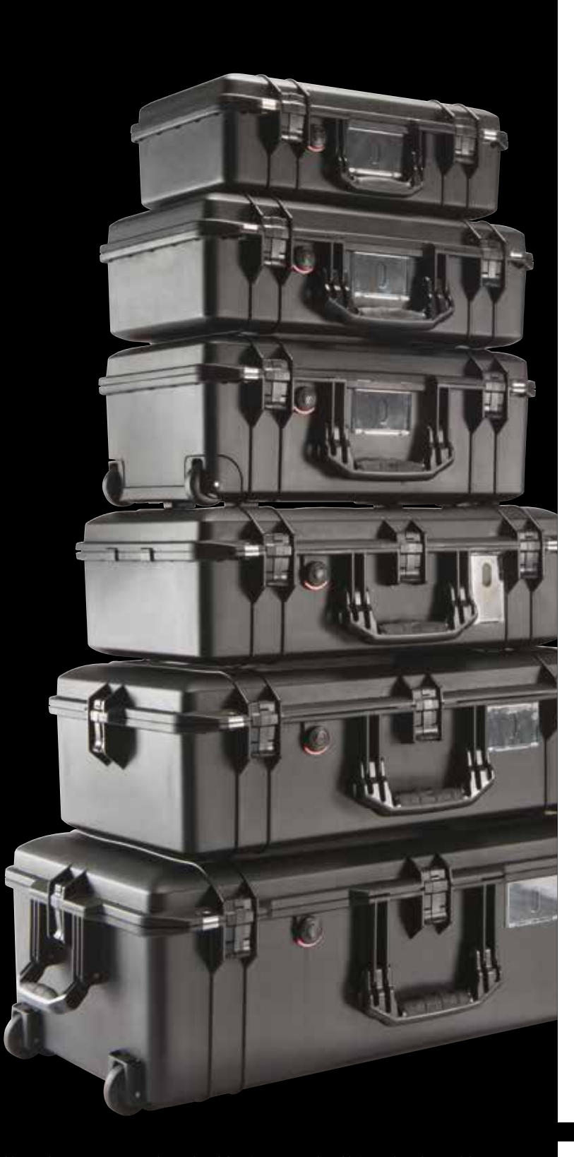
TABLE + OF CONTENTS

Uros Podlogar, professional photographer